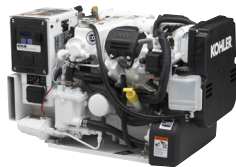
5-kW low-CO gasoline generator

Information, specifications, materials and dimensions are subject to change without notice.